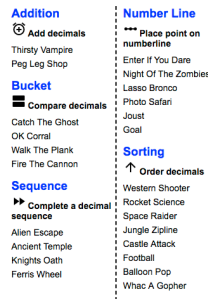
Figure 4. The dashboard shown to students in both of the High Agency conditions showing the mapping between mini-games and target skills.

Pretest, Immediate Posttest, and Delayed Posttest. The pretest, immediate posttest, and delayed posttest (conducted one week after the posttest), were administered online in the same online environment as the game. Each test consisted of 24 items, some with multiple parts, comprising a total of 61 possible points. Test scores are reported as the total number of points earned. Test items were designed to probe for specific decimal misconceptions and took a variety of forms, for instance: adding decimal numbers (e.g., 2.41 + 0.6 = \underline{\quad} ), choosing the next number in a sequence of decimals (e.g., “Write down the next item in the following sequence: 0.201 0.401 0.601 0.801 \underline{\quad} ”), choosing the largest decimal in a given set of decimal numbers (e.g., “Choose the largest of the following three numbers: 5.413, 5.75, 5.6”), and placing a given decimal number on a number line. There were also conceptual questions, such as “Is a longer decimal number larger than a shorter decimal number? Yes, No, It Depends, Don’t Know.” There were three test forms (A, B, and C) that were positionally counter-balanced across conditions. One-way analysis of variance (ANOVA) results showed that there was no significant difference in difficulty between the three forms at pretest, F(2, 236) = 1.272, p = .282 ; posttest, F(2, 236) = 0.220, p = .803 , or delayed posttest, F(2, 236) = 0.339, p = .713 .