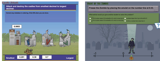
Figure 2. Screenshots of the Castle Attack (left) and Night of the Zombie (right) mini-games from Decimal Point .

Seventy-two decimal problems (three problems for each of the 24 mini-games) have been implemented for the game. Figure 2 shows, respectively, two examples of Decimal Point mini-games: Castle Attack and Night of the Zombie. Castle Attack (left) is an example of an ordering mini-game, where students are challenged to shoot targets in a specified order, either smallest to largest decimal or largest to smallest. Night of the Zombie (right), on the other hand, is a number line mini-game, which tasks students with correctly placing a given decimal point on a number line.